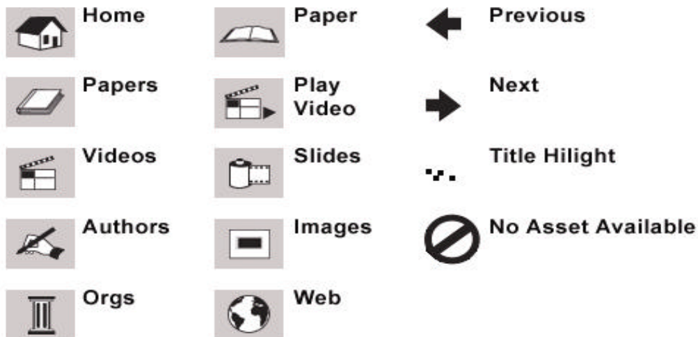
Icons used in the SIGGRAPH 2001 DVD-ROM Figure 1.

To start the Adobe Acrobat interface, double click on the SIGGRAPH2001 DVD icon on your desktop and select the SIGGRAPH2001.pdf . This will launch Adobe Acrobat Reader if you have it installed. You will be able to navigate through all the papers and supplemental materials. This material mirrors the content on the SIGGRAPH 2001 Conference Proceedings CD-ROM.